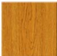
Solara Oak (SO)