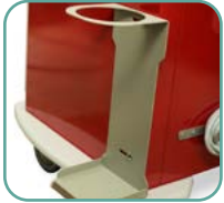
Oxygen tank holder (O2HLDR)