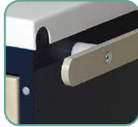
(1) 16" Side Rail (SIDERAIL16)