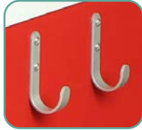
(2) Utility hooks (UHOOKS2)