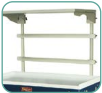
Adjustable Overhead Shelf (MD30-ADJSHLF2)