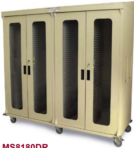
MS8180DR Four Single Columns Standard Key Lock