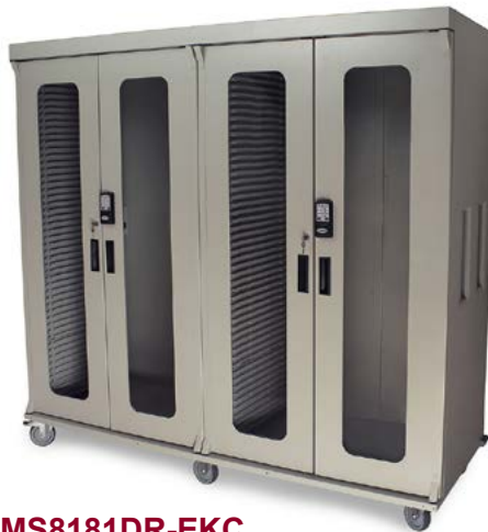
MS8181DR-EKC Two Double Columns Electronic Lock with Keypad