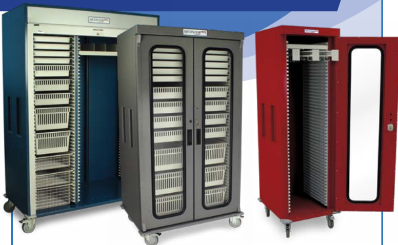
Triple Column | Double Column | Single Column