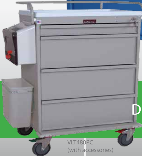
VLT480PC (with accessories)