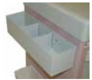
Cup & Straw Holder AL2359