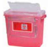
Sharps Container #684802