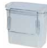
Waste Container #684801