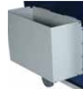
Waste Container #AL680435