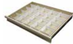
Drawer Divider Tray #680572