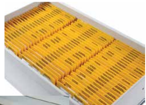
MOT Narcotics Box