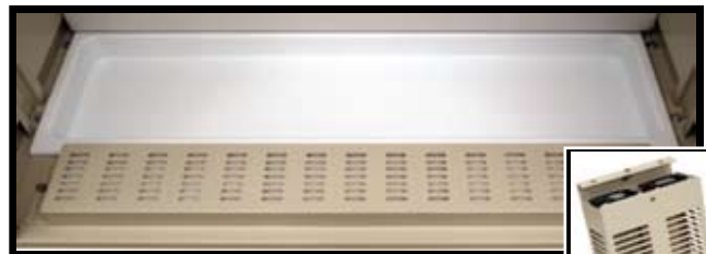
HEPA filter and removable drip tray