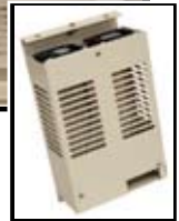
Drying fan has multiple international input options

Color Shown is Sand Custom Colors Available